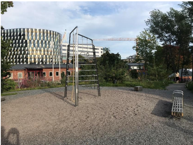
KI Outdoor Gym